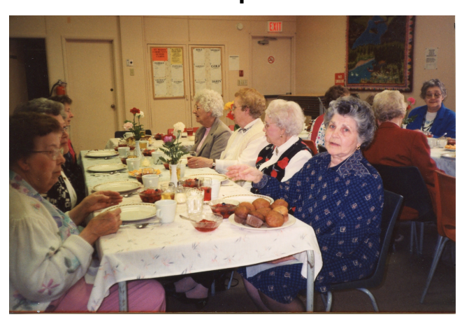
Dining at the original Friendship Centre