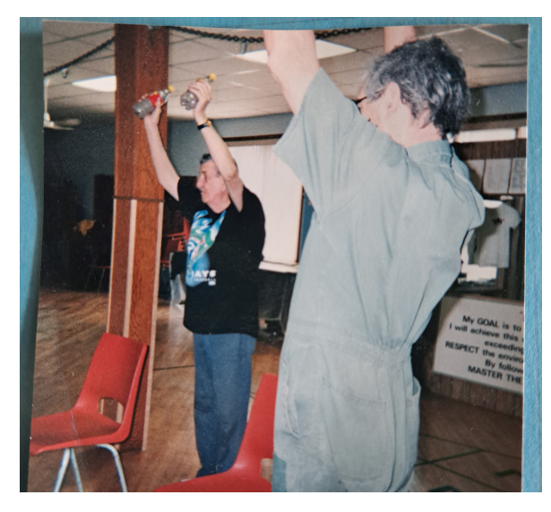
Fitness Class in the old Friendship Centre