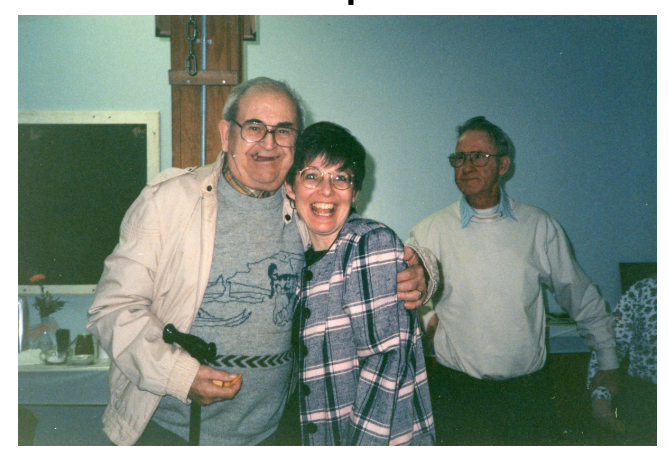
A Place of Fellowship!