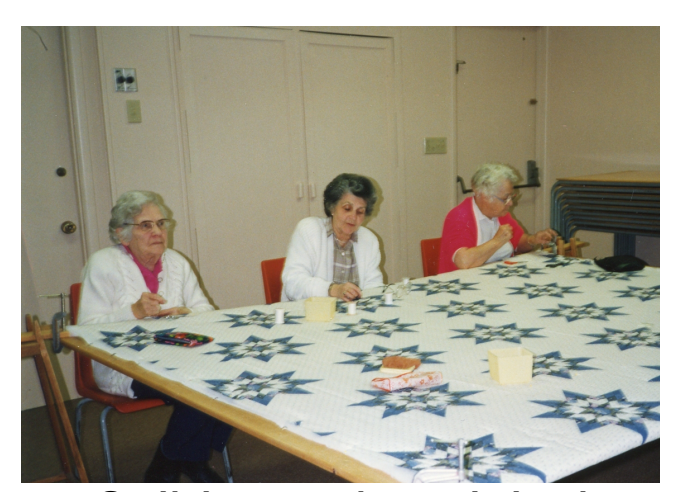
Quilting at the original Friendship Centre